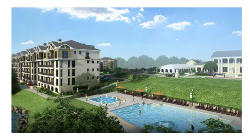
Revery Point's condos are in four-story buildings close to the clubhouse and the pool, as shown in this rendering.

Luxury condos can be found in Nashville on West End Avenue and in the Gulch or in Franklin's Westhaven community, but nothing like that has been available on the north side of the region until now, said Sloan.